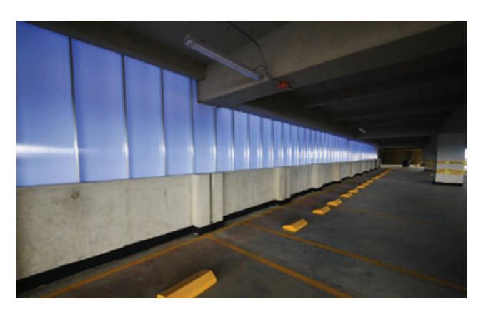
Car parking structures